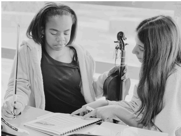
NVYS PEER MENTOR WITH NOTES MUSICIAN

Young musicians ages 8-18 are invited to learn more about our programs, ensembles, and audition process!